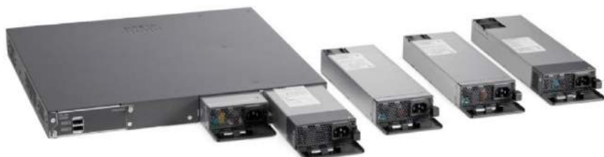
Figure 2. Cisco Catalyst 2960-XR Series power supply

Dual redundant power supplies are supported on the Cisco Catalyst 2960-XR Series Switches. These switches ship with one power supply by default. The second power supply can be purchased at the time of ordering the switch or as a spare. These power supplies have built-in fans to provide cooling (Figure 2).