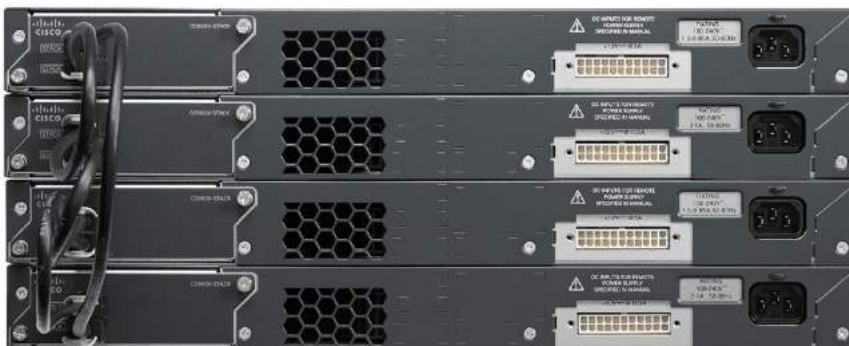
Figure 5. Cisco FlexStack-Plus switch stack