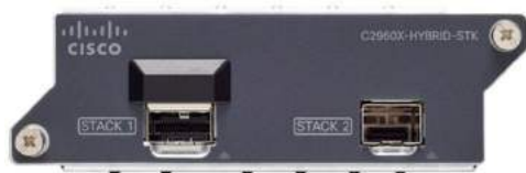
Figure 6. Cisco FlexStack-Extended: Hybrid module