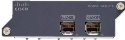
Figure 7. Cisco FlexStack-Extended: Fiber module