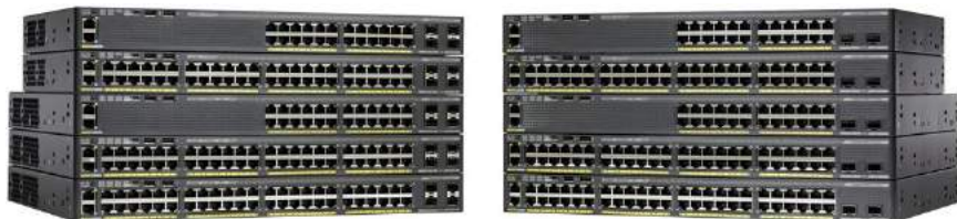
Figure 1. Cisco Catalyst 2960-X Series Switches

Cisco® Catalyst® 2960-X and 2960-XR Series Switches are fixed-configuration, stackable Gigabit Ethernet switches that provide enterprise-class access for campus and branch applications (Figure 1). They operate on Cisco IOS® Software and support simple device management as well as network management. The Cisco Catalyst 2960-X and 2960-XR Series provide easy device onboarding, configuration, monitoring, and troubleshooting. These fully managed switches can provide advanced Layer 2 and Layer 3 features as well as optional Power over Ethernet Plus (PoE+) power. Designed for operational simplicity to lower total cost of ownership, they enable scalable, secure, and energy-efficient business operations with intelligent services. The switches deliver enhanced application visibility, network reliability, and network resiliency.