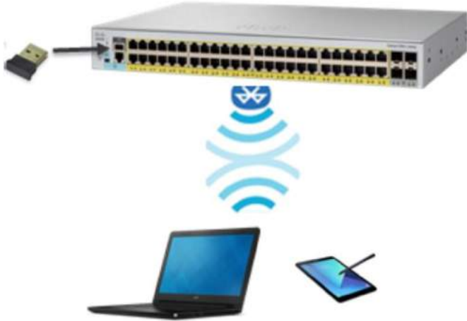
Figure 4. Over-the-air switch access using Bluetooth